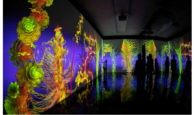
© Miguel Chevalier, VG Bild-Kunst, Bonn 2022

Flowers are of great importance for man and nature alike. Flowers Forever is the first comprehensive exhibition dedicated to the art and cultural history of the flower from antiquity to the present.